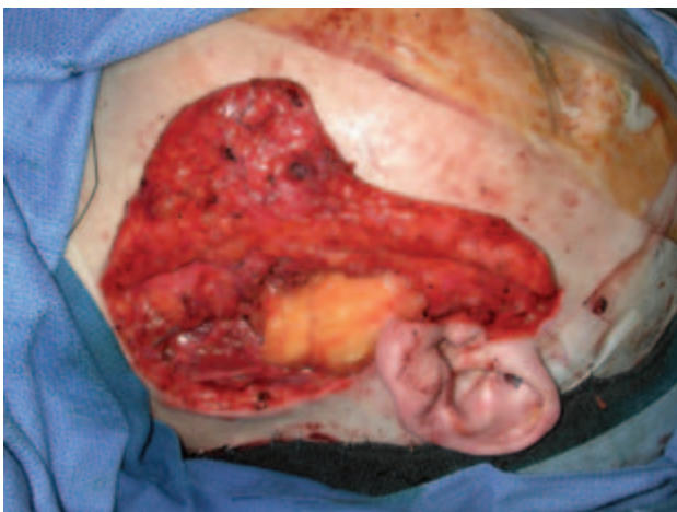
Figure 8.4i. A free abdominal fat graft is placed to reduce "hollowing," which was a concern of the patient.