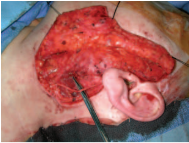
Figure 8.4e. Skin flap raised, the instrument indicates the sensory branch of the greater auricular nerve to the ear, which was preserved in this case.