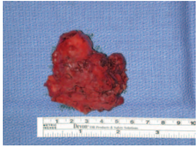
Figure 8.4g. The surgical specimen is seen with the tumor superiorly with no good surrounding "cuff" of tissue.