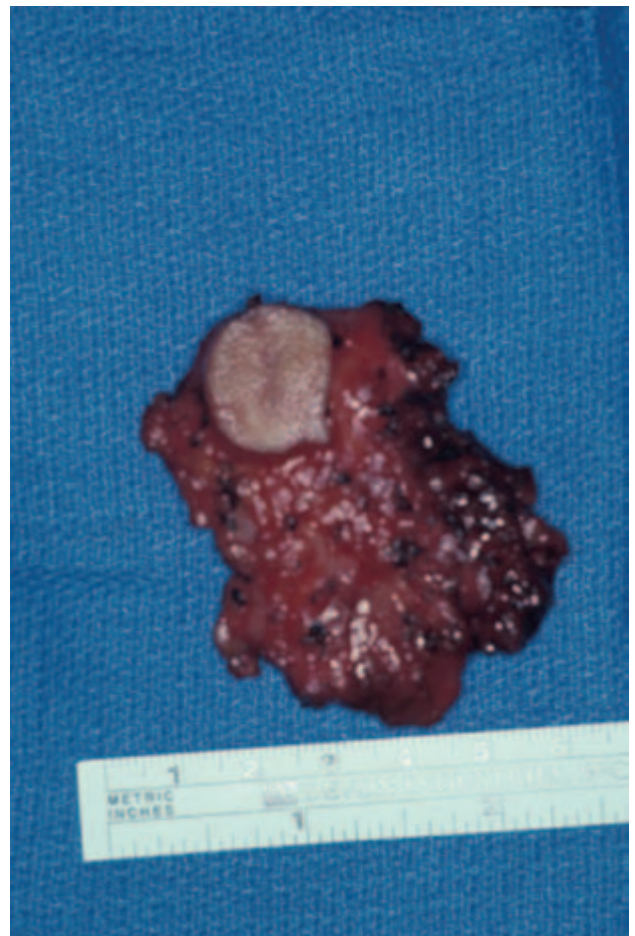
Figure 8.3d. Surgical specimen of parotid with overlying skin.