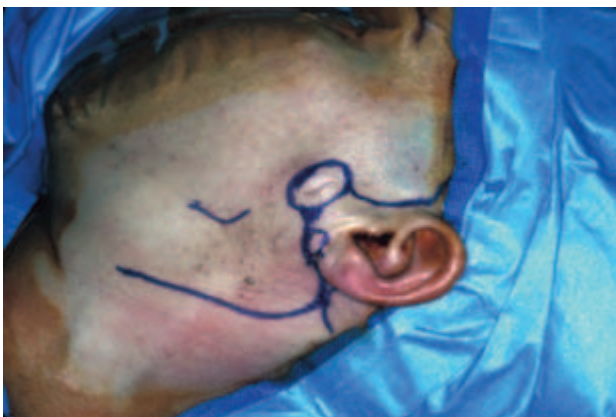
Figure 8.3b. The surgical incision is delineated and includes a 1 cm skin paddle surrounding the biopsy scar.