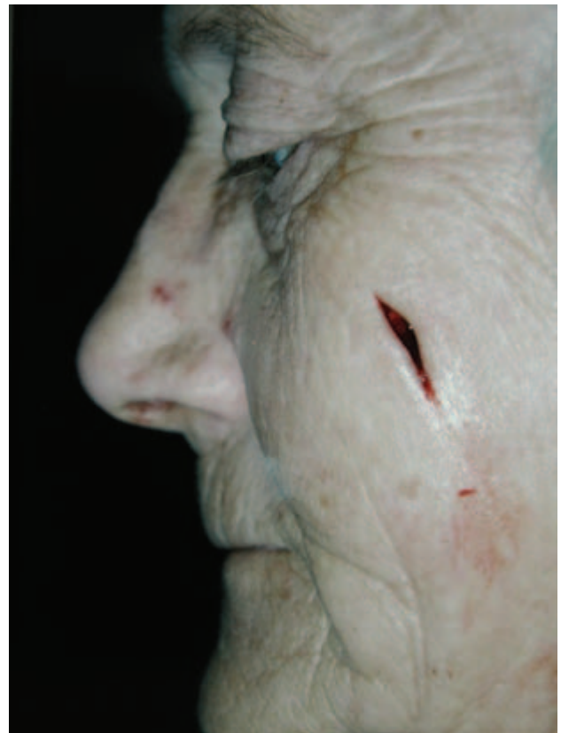
Figure 5.17b. An incision through skin was placed in a resting tension line of the cheek.