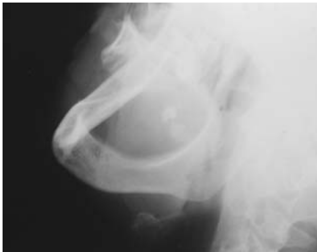
Figure 5.17a. A lateral oblique plain film demonstrating two sialoliths of Stenson's duct.