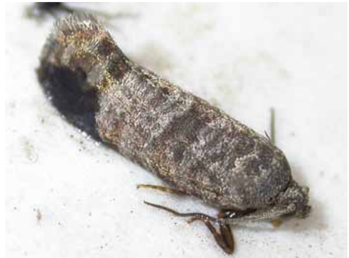
Fig. 1. Codling moth adult