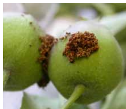
Fig. 4 Frass from codling moth exit