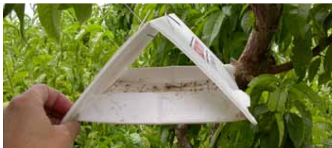
Fig. 5 Delta trap