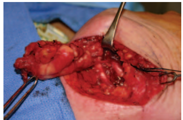
Figure 9.8e. Intraoperative view of extracapsular dissection preserving soft tissue over the tumor surface.