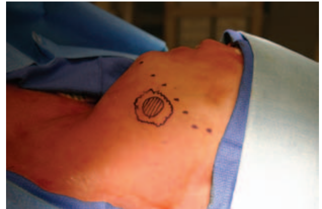
Figure 9.8d. Operative picture showing the tumor marked by palpation.