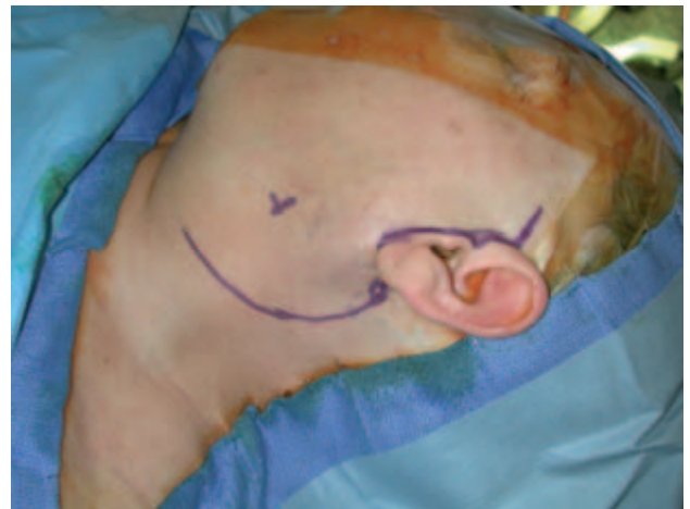
Figure 8.4d. Modified Blair incision.